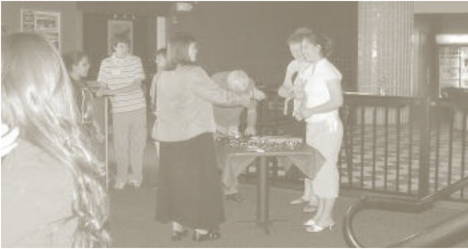
Members of the Youth GrantMakers Council greet Salina City Commissioner Debbie Divine and others as they arrive for the YGMC year-end celebration.