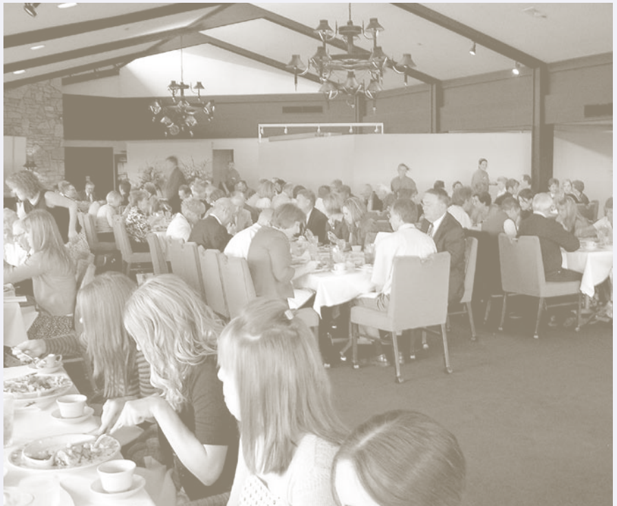
More than 150 people gathered for the Foundation's annual grant luncheon May 13 at the Salina Country Club. The Foundation announced nearly $9 million in grants awarded in the last year.

Grants funded through this partnership meet specific funding criteria established by CHIP committee members. Grant review, allocation of funding and grant administration is provided by the Community Foundation.