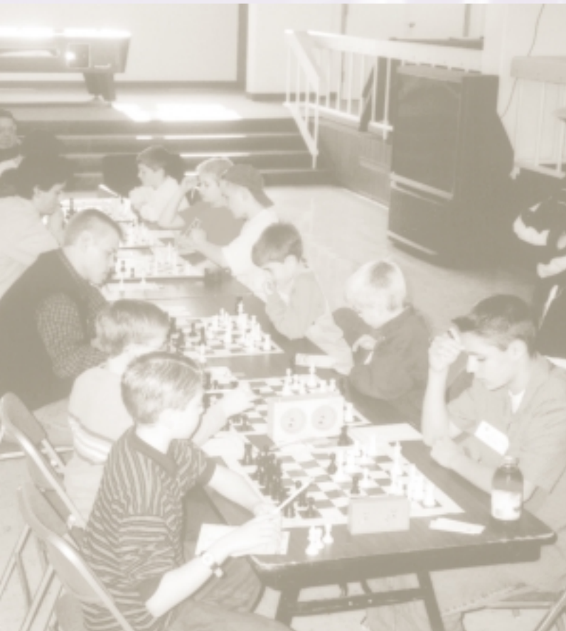
Chess is a game commonly played at home. Salina youth who are interested in learning the game and competing in area tournaments are finding support in the Salina Chess Club. The club purchased teaching materials and chessboards with a grant from the Foundation.

Organization funds are established by or for non-profit organizations that provide for the greater good of the citizens of Saline County. Organizations can establish endowments without creating a separate legal organization. The Foundation provides administration, investment and accounting services. Annual grants back to the organizations provide support for operations and other special projects. Gifts of any size are welcome contributions to an existing organization fund. A minimum of $10,000 within five years is required to establish an Organization Fund.