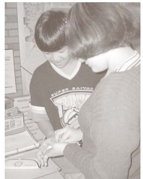
Rescue Mission and Ashby House.

Twice a year the students select charitable organizations to receive a contribution from their earnings. In December, the students donated $300 to the Foundation to be added to the endowments of 5 charitable organizations. Contributions were made to: DVACK, Catholic Charities, Emergency Aid-Food Bank, Salina