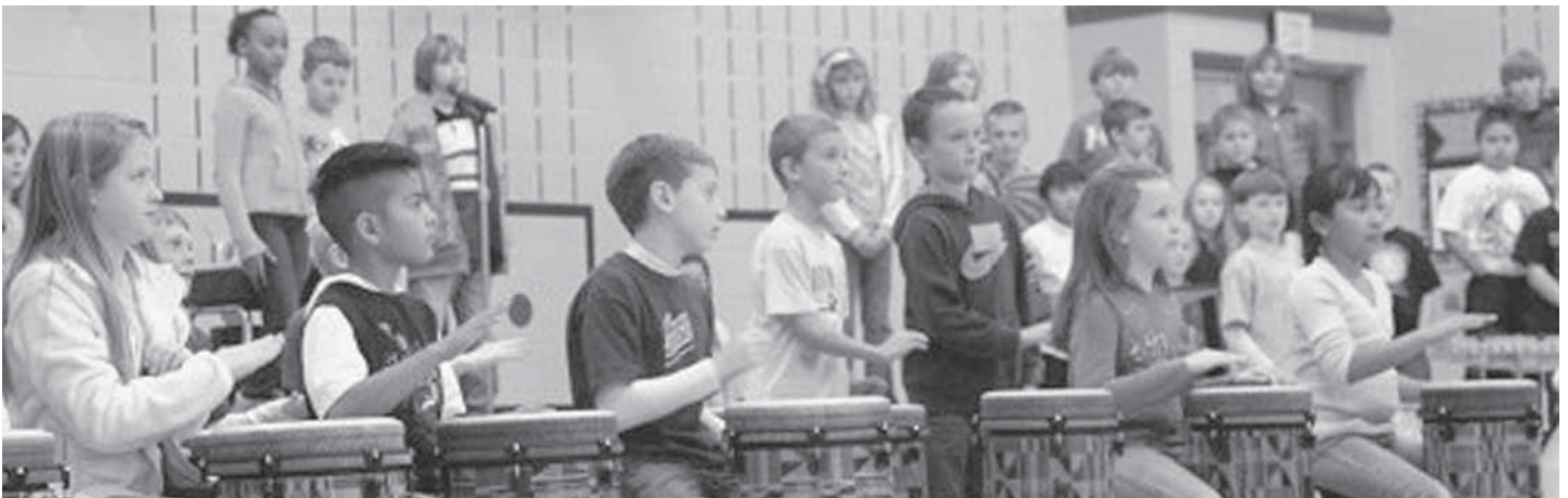
A spring 2010 grant from the Foundation provided funds to purchase these Tubano drums to expand the music curriculum for the 412 students in grades K-5 at Coronado Elementary School.

"Sometimes one person's voice can make the difference when deciding a grant."