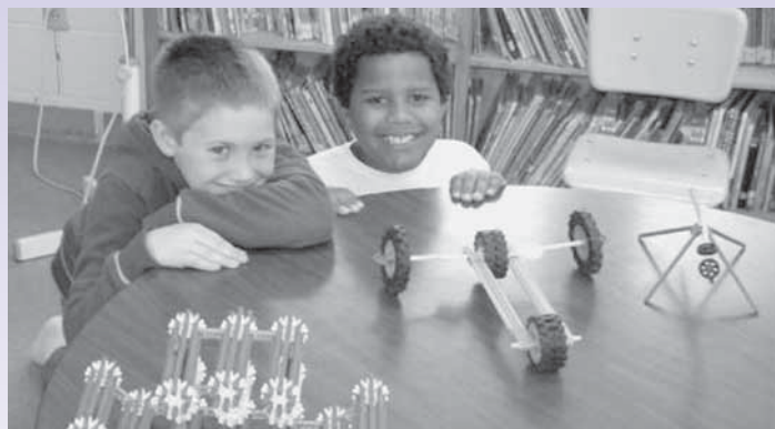
Children in the Belleville After School Program received a variety of new toys through a $300 grant from the Republic County Community Action Fund in the Republic County Community Foundation.

Affiliates receive financial and administrative services, marketing support, training and technical assistance from GSCF. Local boards, and in some instances local staff are responsible for fundraising and grant making.