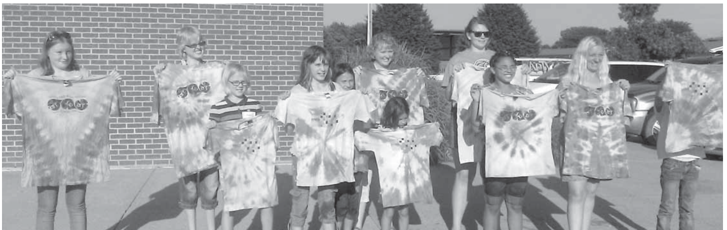
Bigs and Littles participate in an art workshop where they made their own ty-dyed shirts. A grant from the Foundation assists in recruiting and training Bigs for Big Brothers and Big Sisters of Salina.

"Unity is important but diversity is more important."