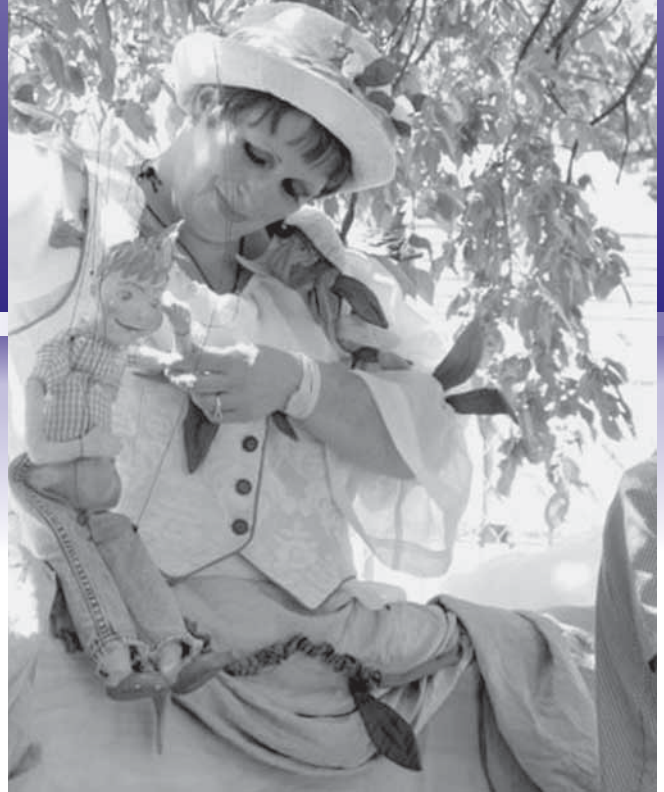
In the second year of a three-year grant to the Salina Arts & Humanities Commission, Arty, the mobile arts van brought a variety of art projects to children in the community throughout the summer. The van visited parks, summer food sites and other locations where families or youngsters gathered.