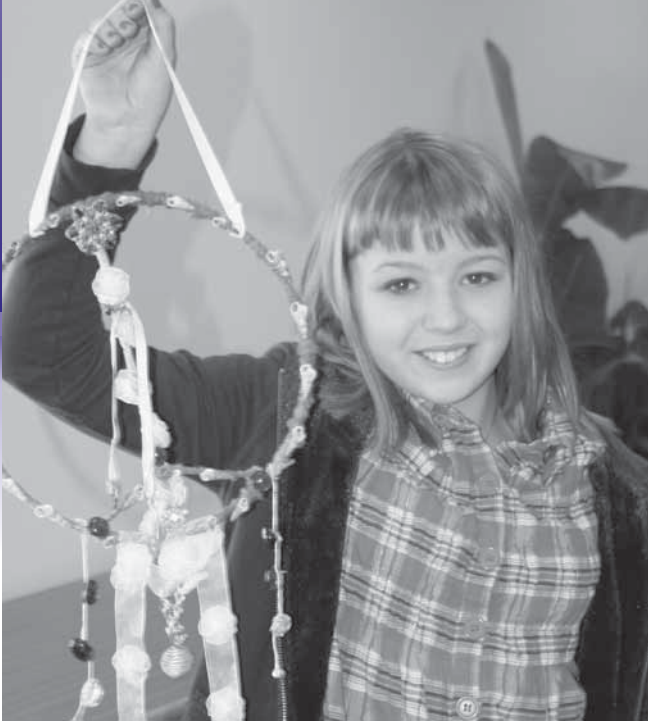
A spring break camp at Rolling Hills Zoo and Museum offered area youth an opportunity to learn important spending skills as well as complete hands-on art projects like this dream weaver.