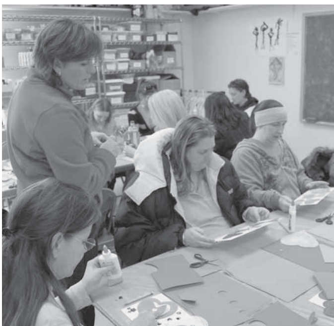
A Foundation grant helped to fund a groundbreaking program at the Salina Art Center where families from the Ashby House participated in art projects together and also received take-home art kits to continue positive parenting interactions on their own.

Big Brothers Big Sisters of Salina Boy Scouts of America, Coronado Area Council Child Abuse Prevention Services Child Care Aware of Kansas Girl Scouts of Central Kansas Heartland-Head Start KIAAA Endowment Martin Luther King, Jr. Child Development Center Saint Francis Community Services Salina Child Care Association Saline County 4-H Development Teen Town, Inc. The First Tee of Saline County Webster Conference Center