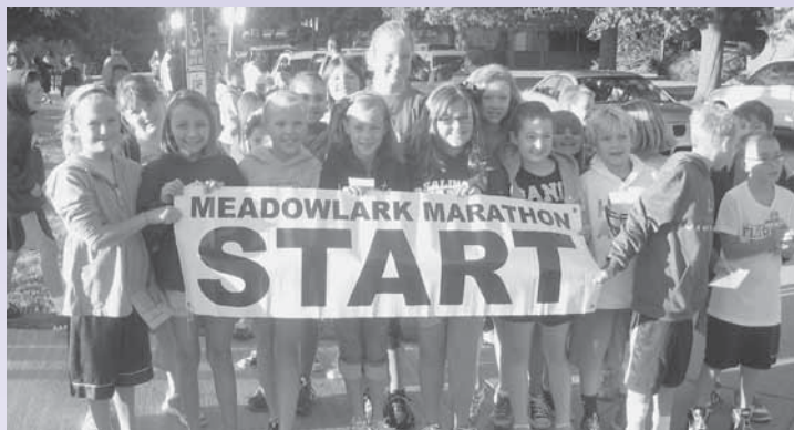
Students proudly hold the banner announcing the start of the 2011 Meadowlark Marathon, one of seven school marathons being funded by a Foundation grant.

Year two is also the second year of a significant grant to the City of Salina to expand the levee trail system. In the first year the trail was extended from Crawford to Cloud streets. Last year the Foundation granted $32,000 for phase two of the expansion which will extend the biking/hiking trail from Bill Burke Park to North Street by the end of next year. The completed trails will be 10 feet wide and have a layer of limestone aggregate.