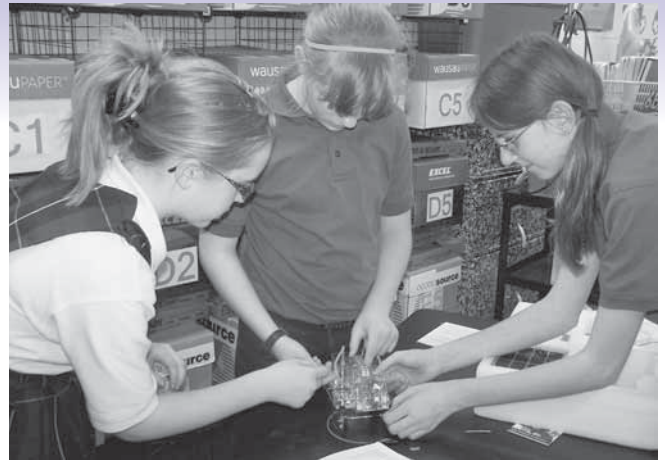
A grant from the L.P. "Pat" Mullen Fund for Science, Technology and Invention provided materials to teach solar energy to students at St. Mary's Grade School. Here students work on a solar powered car.

*$5,000 - Salina Child Care Association: Funding will provide scholarships for low-income families which will allow parents to maintain jobs and provide children with quality early childhood care and education