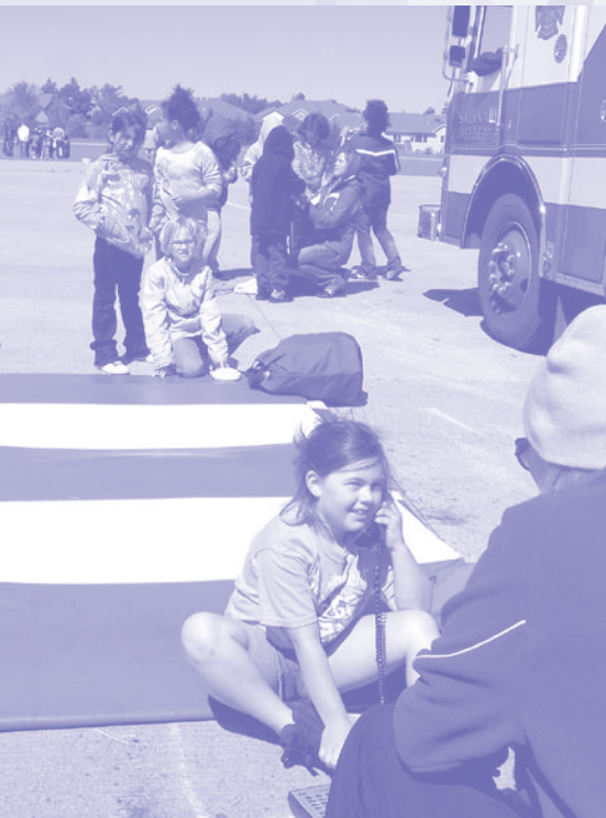
Third graders enjoyed the Kansas Kids Fun & Fitness Day on May 7, funded in part with a grant from the Foundation.

$1,400 Salina Rescue Mission — to purchase a roto-tiller to expand and maintain a vegetable garden. Produce will be shared