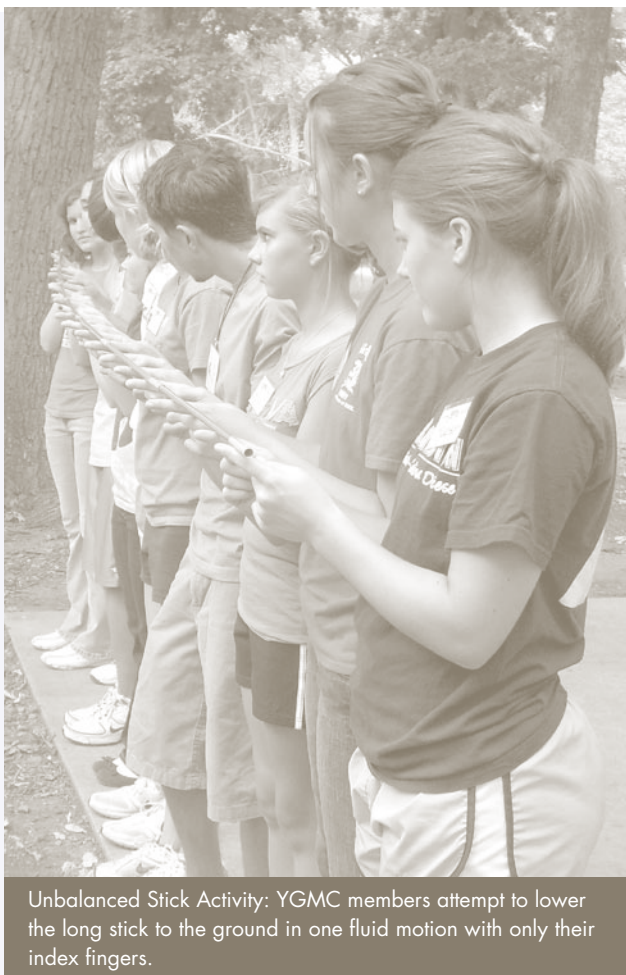
Unbalanced Stick Activity: YGMC members attempt to lower the long stick to the ground in one fluid motion with only their index fingers.

Ell-Saline Miranda Basinger Jordan Pieschl